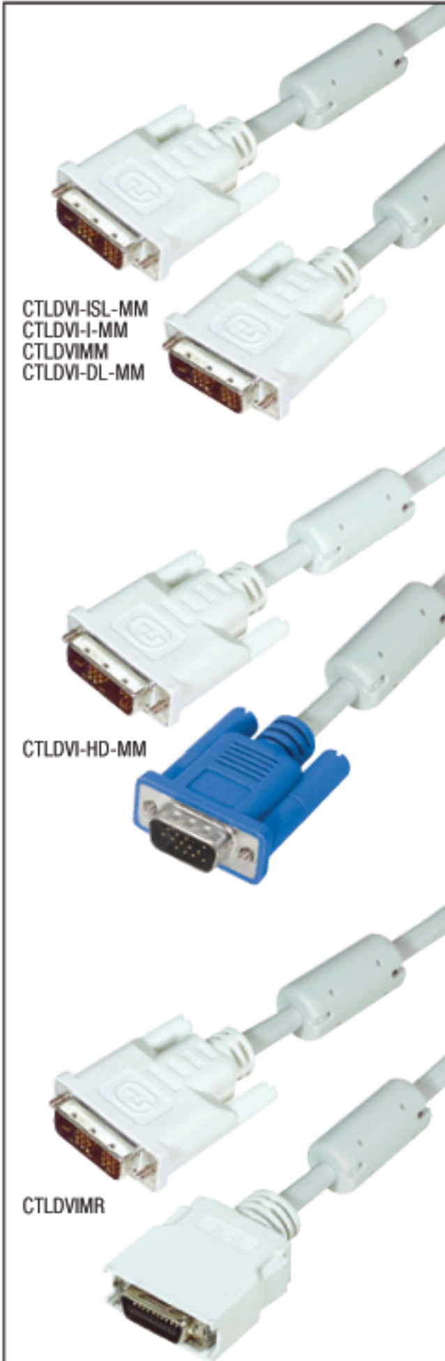
CTLDVI-ISL-MM CTLDVI-I-MM CTLDVIMM CTLDVI-DL-MM